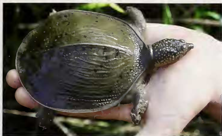
Fig. 18. Cyclanorbis senegalensis , juvenile from Pendjari NP, northern Benin.